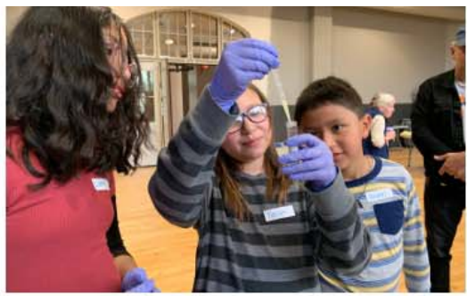
THE SCIENCE CLUS