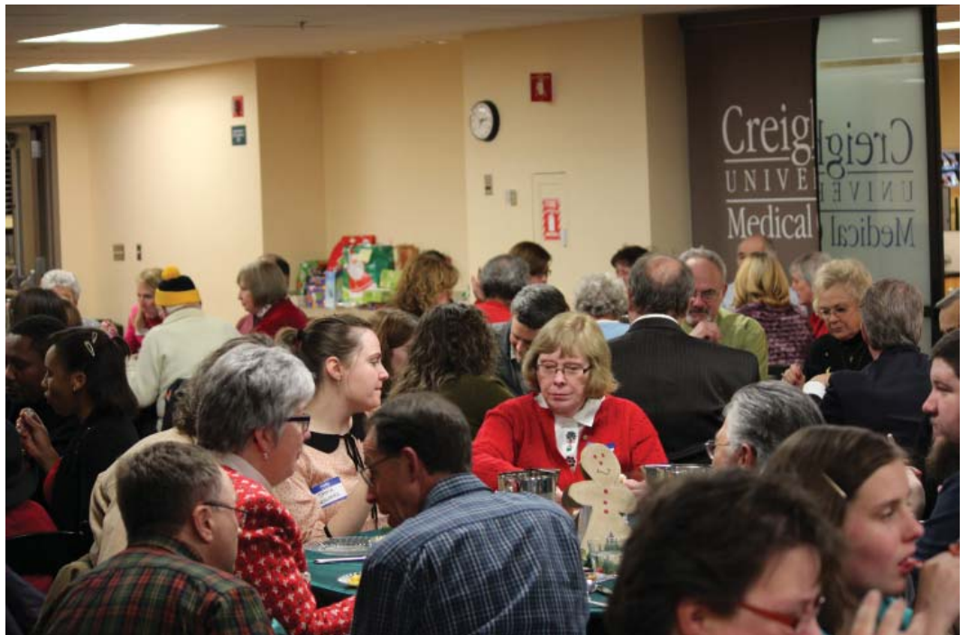
Neighborhood residents and friends enjoy dinner and conversation.