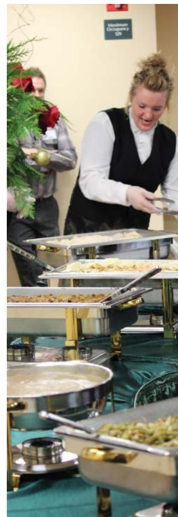
Guests enjoy holiday dinner catered by Alegent Creighton