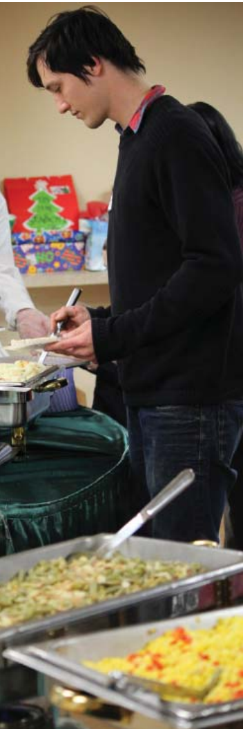
... with all of the trimmings ... on Health