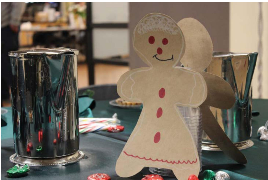
Gingerbread people by Dana Carlton-Flint decorated our tables.