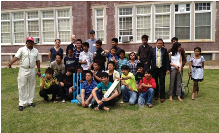
Cricket players pause for a picture. For more pictures of the Cultural Event see page 4.