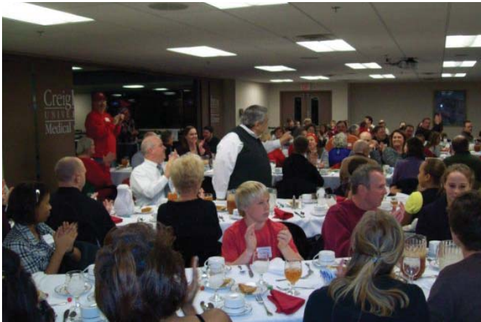
Neighbors gathered December 15 for the 23rd Annual Holiday Banquet.