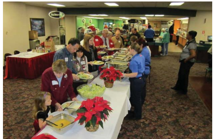
Sodexo once again graciously provided a holiday buffet with all of the trimmings.