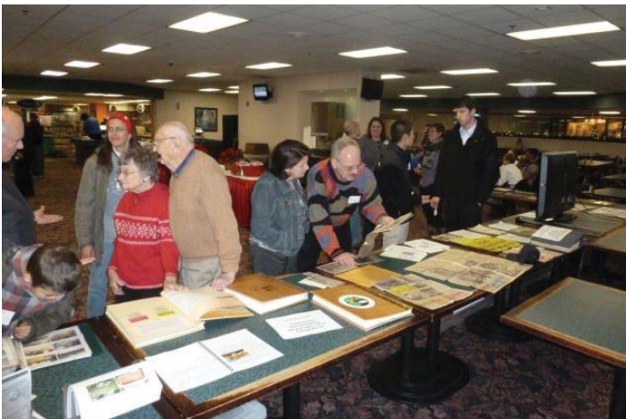
Neighbors learn and reminisce about the history of our neighborhood.