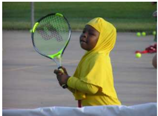
Upper Right: An eager tennis program participant waits to make a return at the net