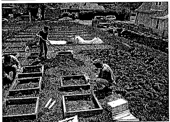
Volunteers help prepare the raised beds for the Community Garden Youth Program by filling the frames with dirt. Each participant will have his or her own bed for growing vegetables and will be responsible for taking care of it.