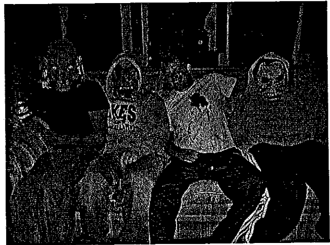
Some of the ghoulish "residents" of the PKA Haunted House take a break from scaring their "guests" from the Gifford Park neighborhood. Over 30 members of the Creighton fraternity participated in this year's event.