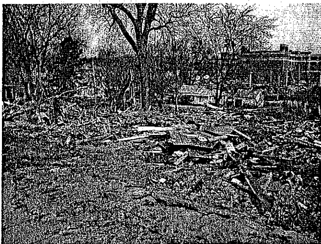
The landscape of the Gifford Park neighborhood has changed dramatically in the last few weeks with the demolition of nearly all the houses between 30th -32nd, California to Webster St. Creighton University is conducting the demolition as part of its campus expansion project.