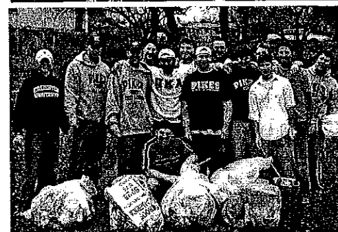
GPNA Easter Egg Hunt 2002: The Easter Bunny and her "fans", boys and girls eagerly awaiting the start of the hunt, and the Pi Kappa Alpha Creighton fraternity, who helped clean up the park.