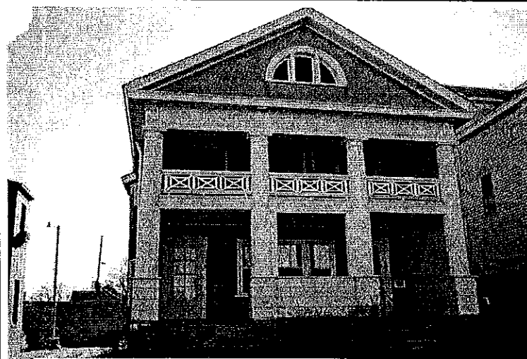
An example of the wide variety of architectural styles present in the Gifford Park Neighborhood. This house is located at 3315 Cuming.