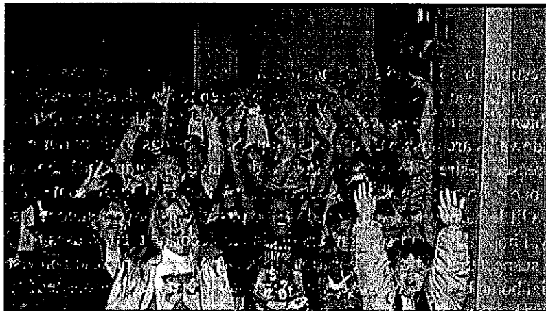
The fourth annual Halloween Haunted House, a joint project of Creighton's Pi Kappa Alpha fraternity and the GPNA was a big hit with the neighborhood kids again this year. Thanks to the members of PKA for hosting the event and the GPNA members who donated baked goods and other treats.