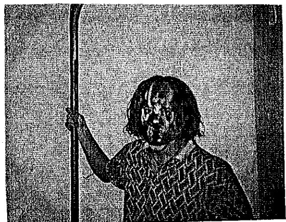
"Ghouls" like this PKA fraternity member greeted over 100 neighborhood kids at the haunted house.

For the third straight year, Pi Kappa Alpha turned its fraternity residence into a Halloween haunted house for neighborhood children on Thursday night, October 30th. Despite the snowstorm earlier in the week, over 100 kids showed up to tour the house and enjoy the treats and refreshments. The Gifford Park Neighborhood Association would like to thank the PKA fraternity from Creighton University for hosting the event, and several GPNA members who donated some of the treats and refreshments. For the Gifford Park neighborhood children, it was a night to remember!