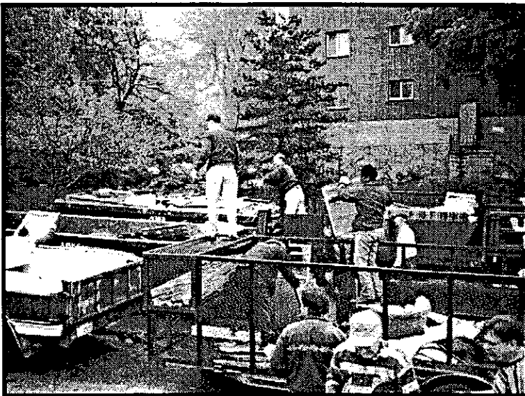
Neighborhood volunteers packed 13 dumpsters here in Gifford Park during this year's Spring Cleanup.